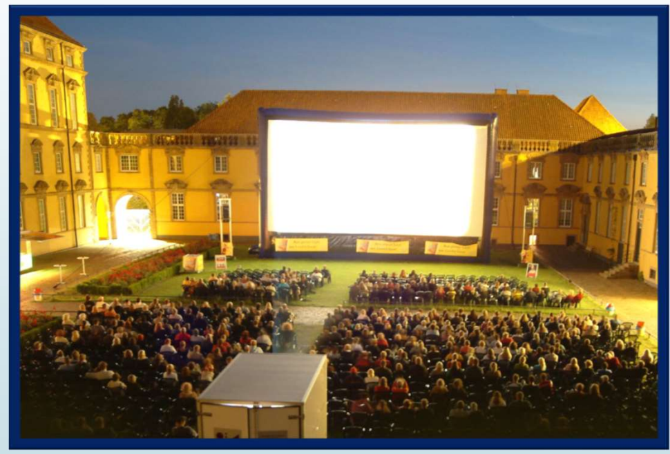
Open air cinema