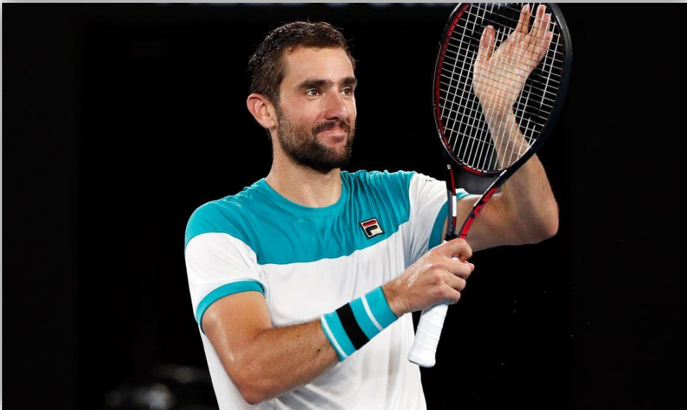
Marin Čilić, tennis