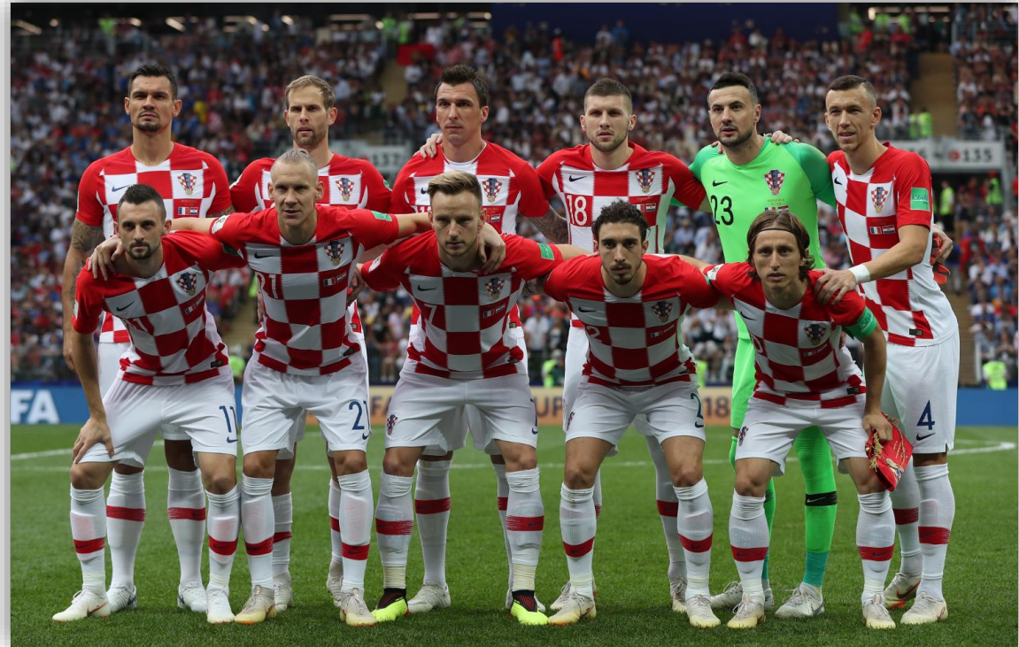
Croatian football team