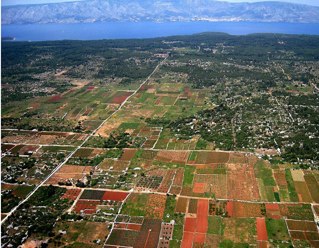
Starogradsko polje on the island of Hvar