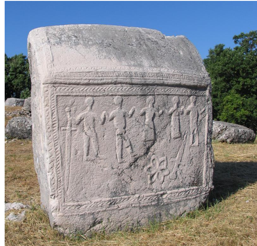
Stećci Medieval Tombstone Graveyards