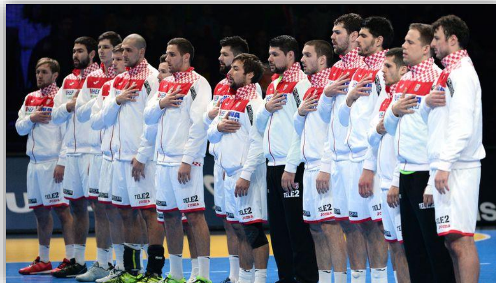
Croatian handball team