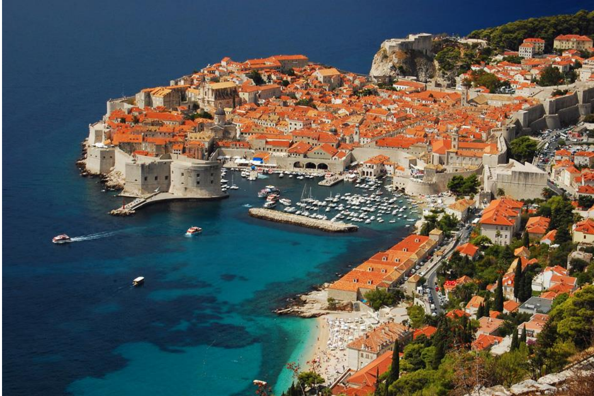
Old City of Dubrovnik