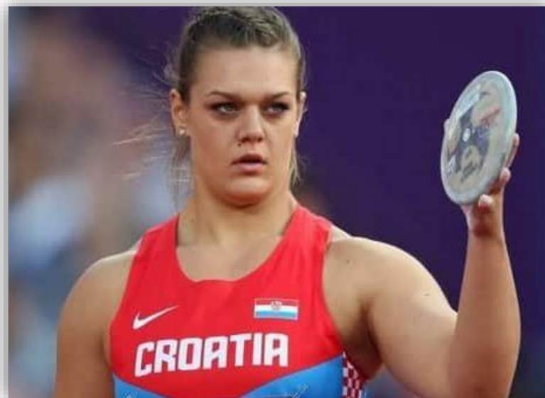
Sandra Perković, athlete