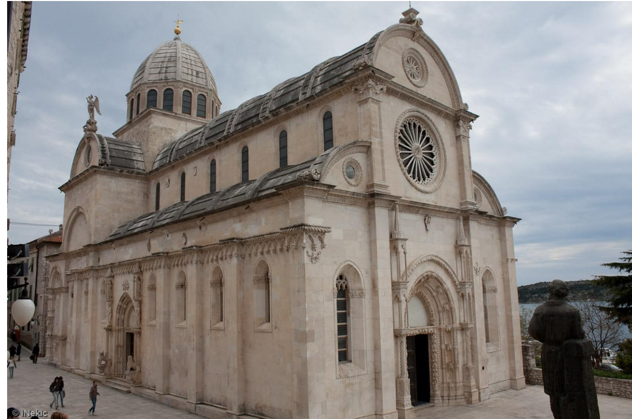
The Cathedral of St James(Jakov) in Šibenik