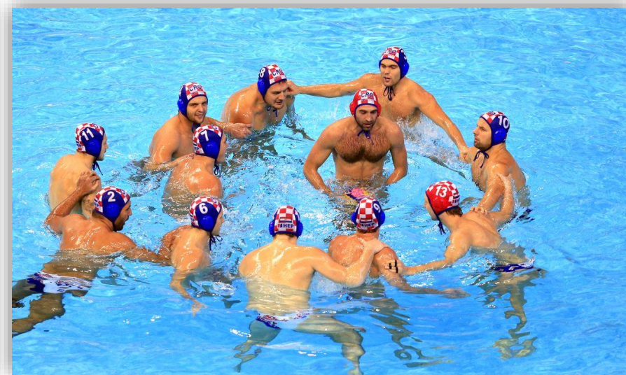
Croatian water polo team