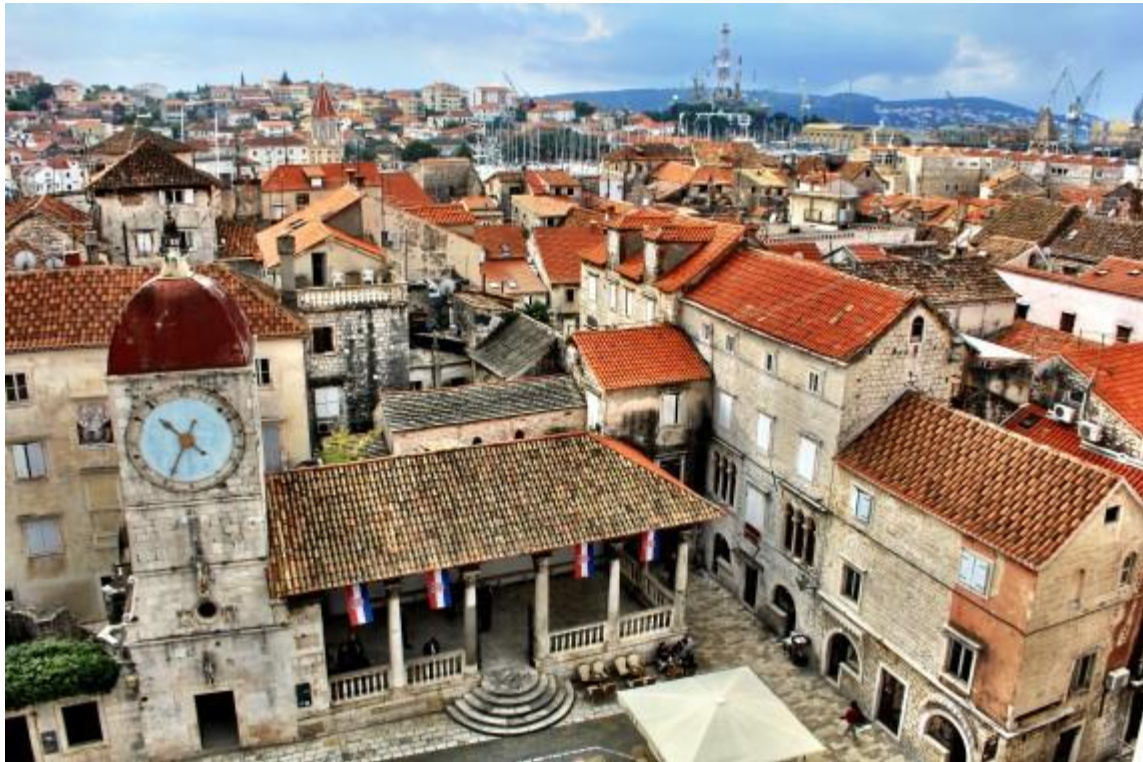
Historic City of Trogir