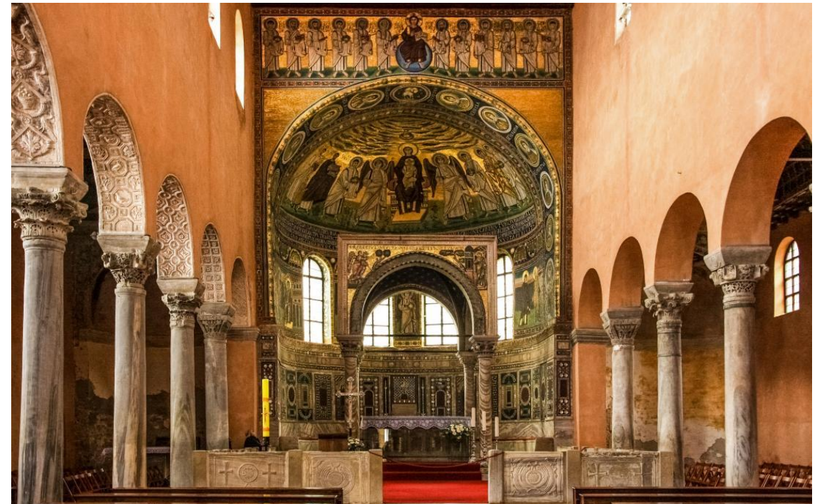
Episcopal Complex of the Euphrasian Basilica in the Historic Centre of Poreč